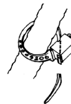
Figure 3: Removing excess strap