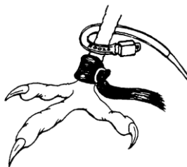
Figure 2: Placing the band